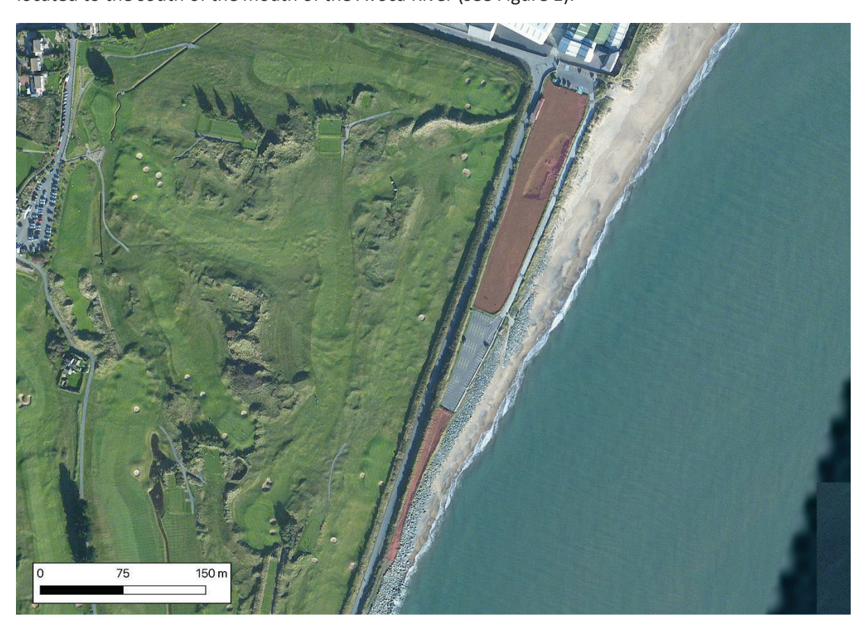
Figure 1. Site Compound 6 at Arklow marked in brown.

One of the areas, Site Compound 6 (SC6) with a total area (ex. carparks) of ca 8,500m<sup>2</sup>, that has been identified as a site at which dredge material from the proposed deepening of the Avoca River upstream of the bridge in Arklow is to be stored for later examination archaeological remains is located to the south of the mouth of the Avoca River (see Figure 1).