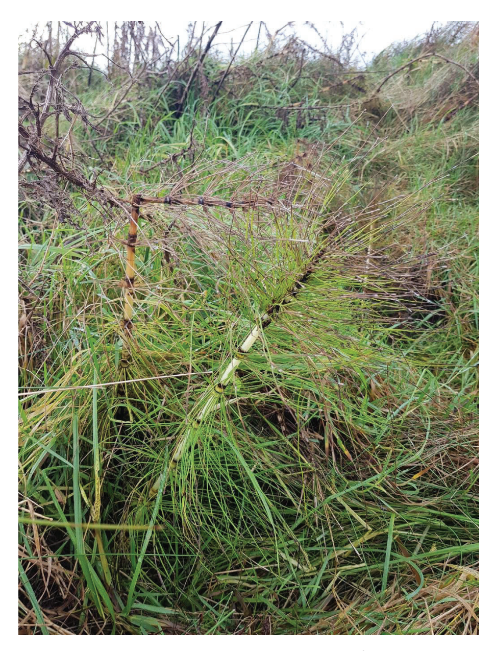
Photo. 1. Equisetum telmateia on the bank at the back of the carpark.